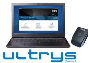
ULTRYS programming kit and SSCP® and OSDP™ protocols