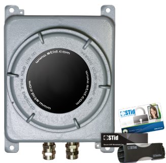
UHF reader with a built-in antenna - ATX